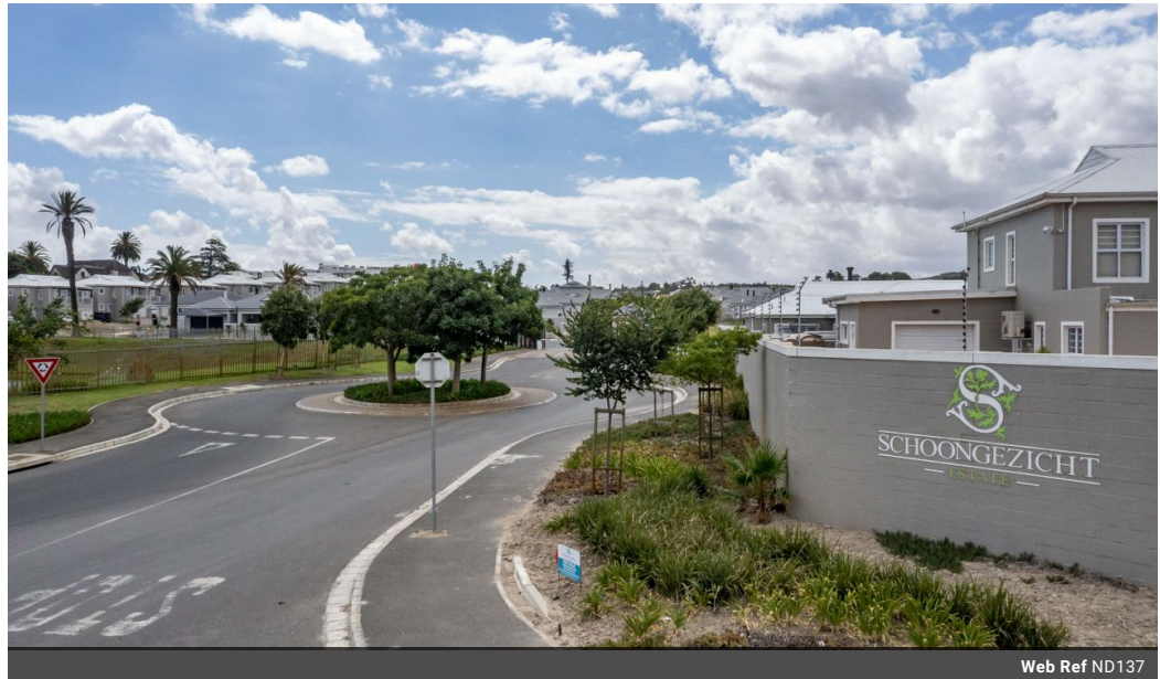
Web Ref ND137

Unit 1, Ground Floor, 13 Oxford Street, Durbanville, 7550