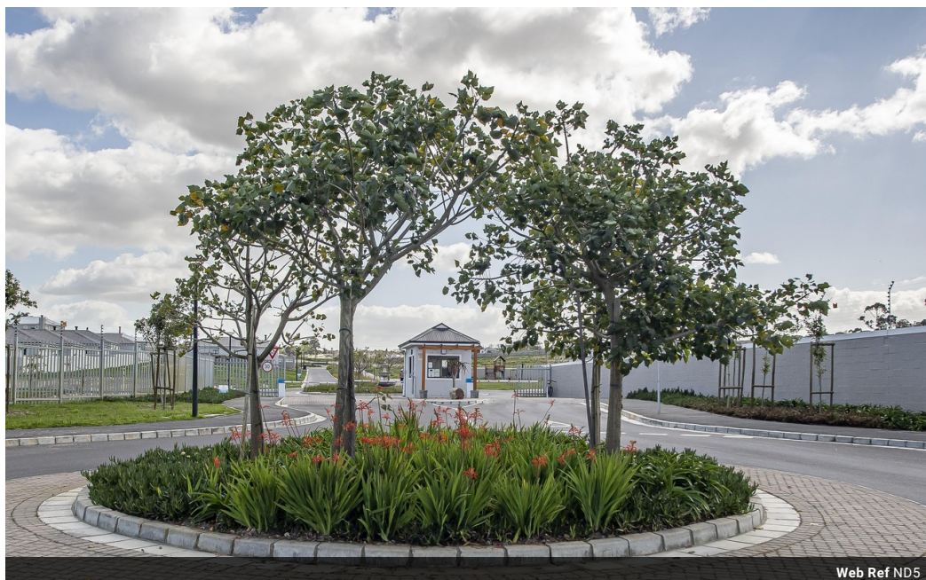
Web Ref ND5

Unit 1, Ground Floor, 13 Oxford Street, Durbanville, 7550