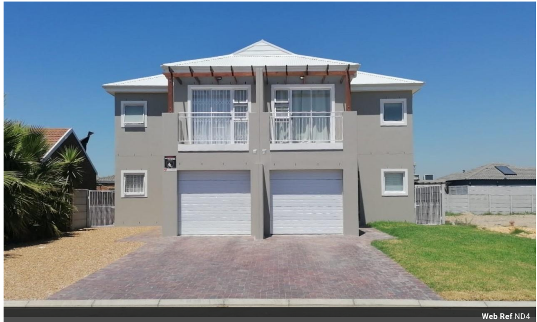
Web Ref ND4

Unit 1, Ground Floor, 13 Oxford Street, Durbanville, 7550